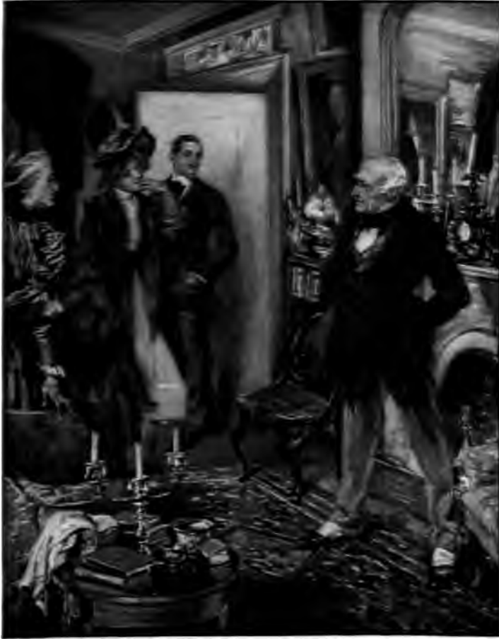
She sent another kiss flying through the air.